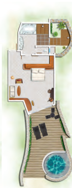
Beach Front Suite with pool