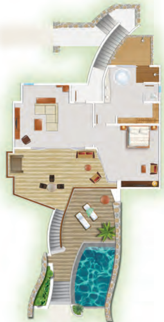
Beach Front Senior Suite with pool