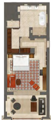
• Junior Suite