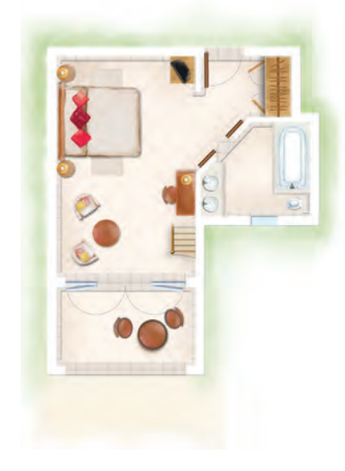
Family Duplex - Ground floor