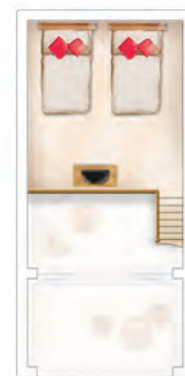
Family Duplex mezzanine