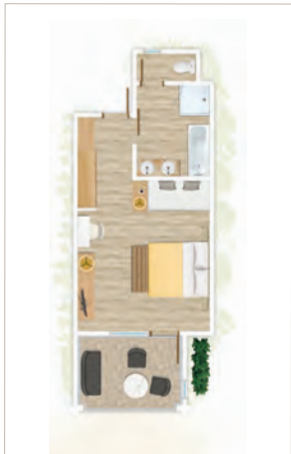
Deluxe Sea Facing Room