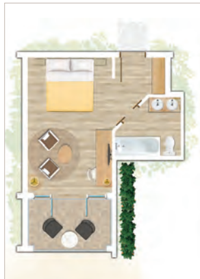
Standard Sea facing