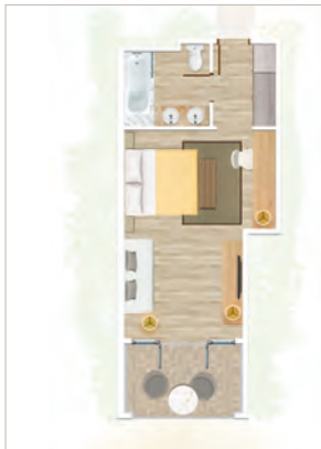
Superior Garden / Superior Sea facing