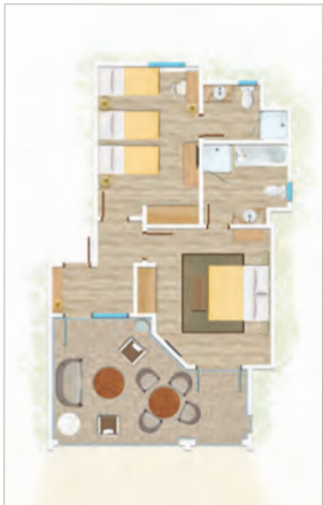
2-Bedroom Family Apartment