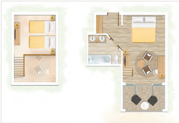
Family Duplex Garden / Family Duplex Sea facing