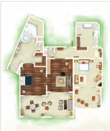
2-Bedroom Luxury Beachfront Family Suite