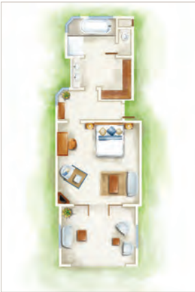
Tropical Room / Junior Suite Beachfront / 2-Bedroom Beachfront Family Suite (interleading)