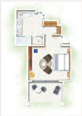
Ocean Beachfront Room / 2-Bedroom Ocean Beachfront Family Suite (interleading)