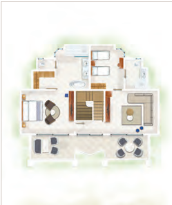
2-Bedroom Luxury Ocean Beachfront Family Suite