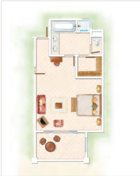
Deluxe Room / Deluxe Ground Floor