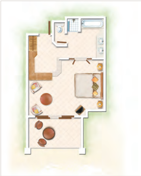
Superior Room / Superior Ground floor