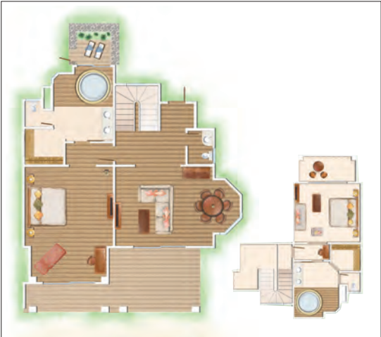
2-Bedroom Family Suite