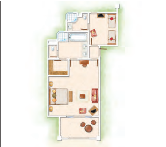
2-Bedroom Family Apartment