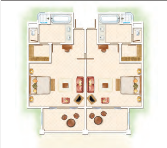
2-Bedroom Deluxe Family Apartment