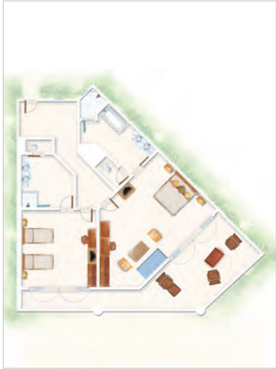
2-Bedroom Family Apartment