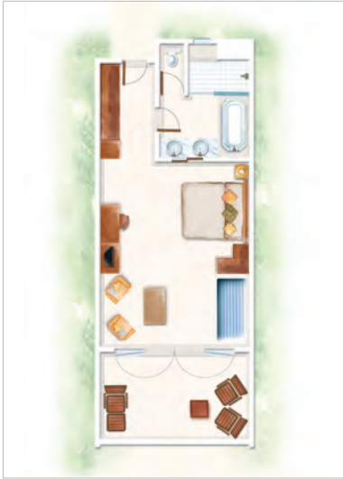
Superior Room First Floor