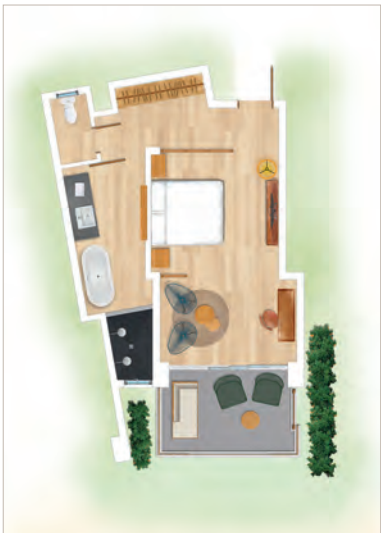
Ocean View Room