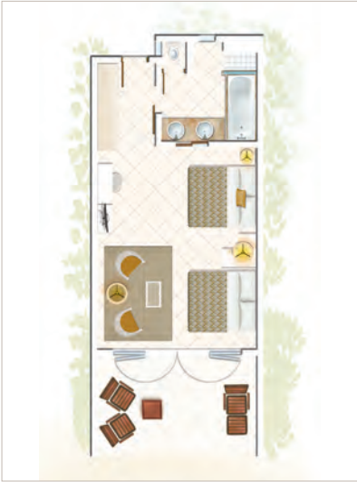
Deluxe Room / Deluxe Ground Floor