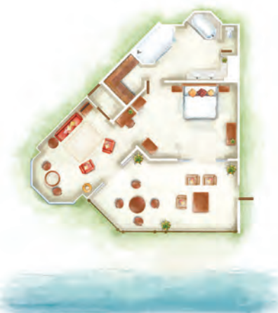
Club Senior Suite Beach Front