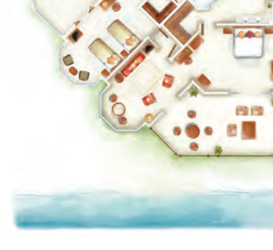
Family Suite Club Family Suite