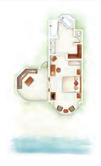
Club Family Suite

Club Senior Suite Beach Front / Senior Zen Suite