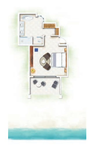
Tropical Room / Tropical Beachfront Room