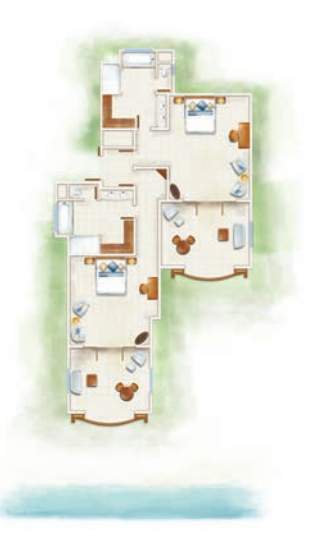
2-Bedroom Tropical Family Suite