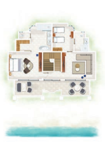
2-Bedroom Ocean Beachfront Family Suite