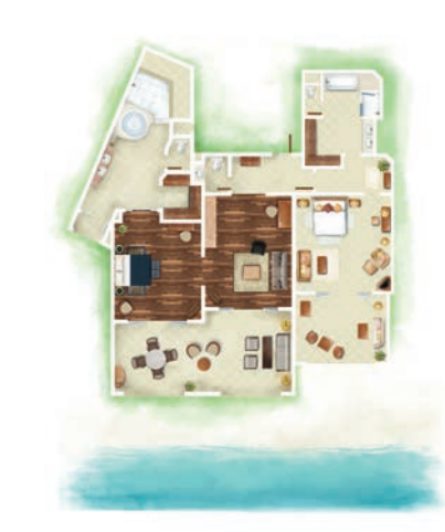
2-Bedroom Luxury Family Suite Beachfront