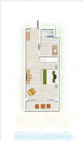
Standard Room / Standard Beachfront