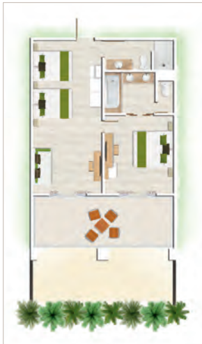
2-Bedroom Family Apartment