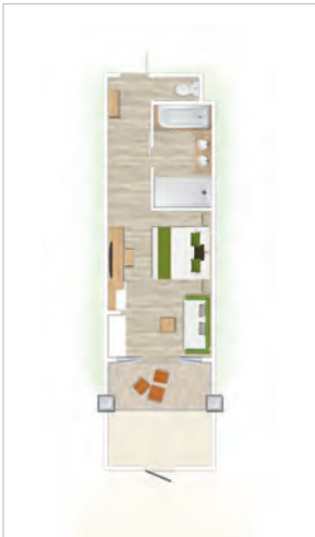
Superior Room / Superior Beachfront