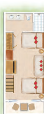
Loft 2 nd room