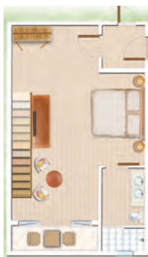
Loft - Main room