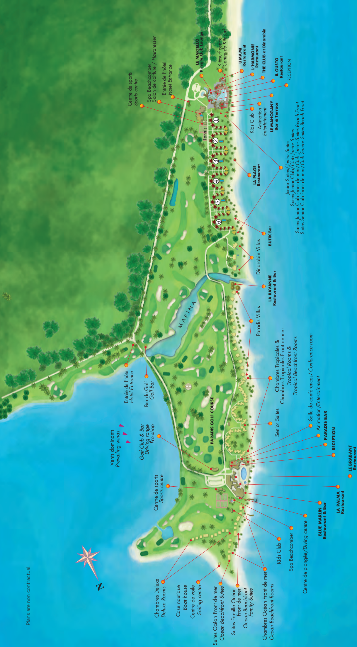
PARADIS BEACHCOMBER GOLF RESORT & SPA