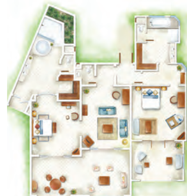
Luxury Family Suite