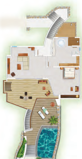
Beach Front Senior Suite with pool