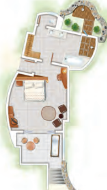
Tropical Junior Suite