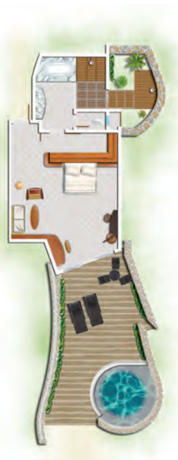
Beach Front Suite with pool