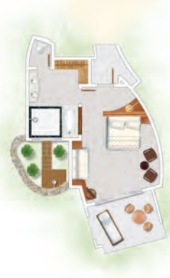
Tropical Junior Suite +