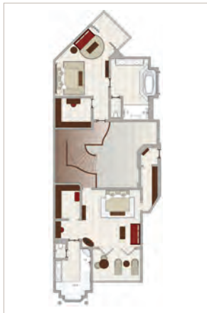
Royal Suite - First Floor