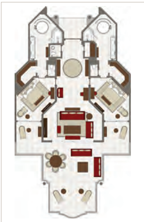
Crystal Rock Suite, Coin de Mire Suite, Gabriel Island Suite