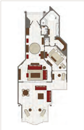
Gabriel Island Suite