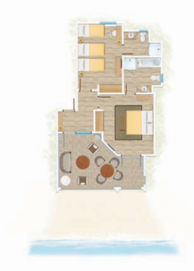
2-Bedroom Family Apartment