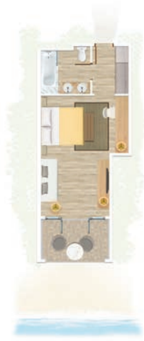
Superior Garden / Superior Sea facing