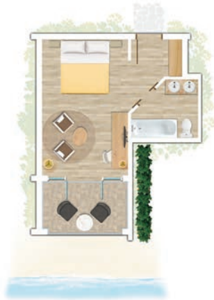
Standard Sea facing