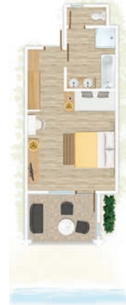
Deluxe Sea Facing Room