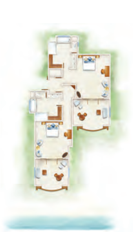
Tropical Family Suite