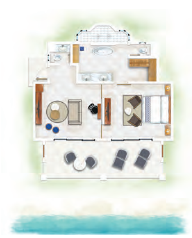
Ocean Beachfront Suite