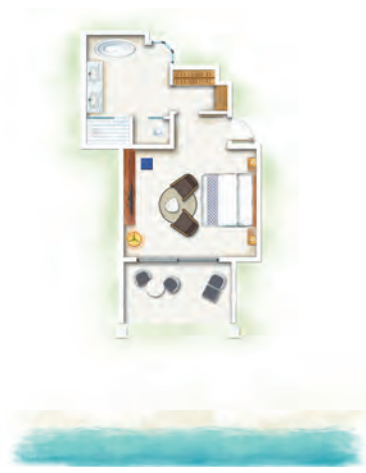
Ocean Beachfront Room