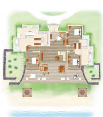
Presidential Villa (ground floor)