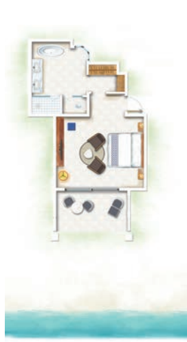
Ocean Beachfront Room