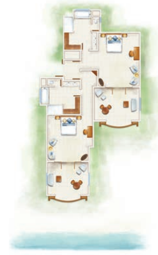
2-Bedroom Tropical Family Suite