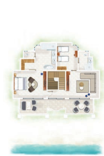
2-Bedroom Ocean Beachfront Family Suite