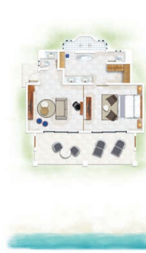
Ocean Beachfront Suite