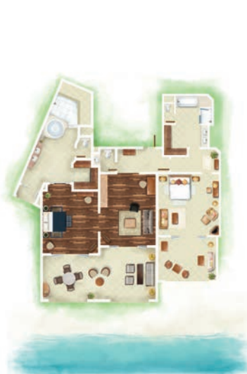
2-Bedroom Luxury Family Suite Beachfront