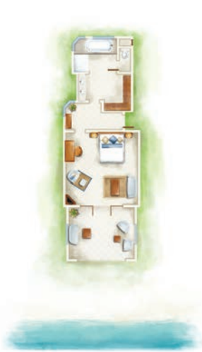
Tropical Room / Tropical Beachfront Room