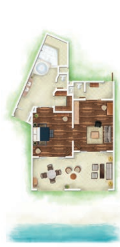
Senior Suite Beachfront