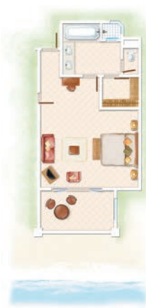
Deluxe Room / Deluxe Ground Floor