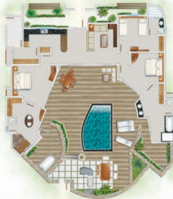
3-Bedroom Pool Villa