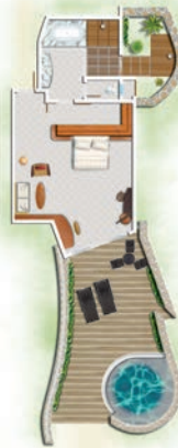
Beachfront Suite with pool