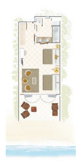
Deluxe Room / Deluxe Ground Floor