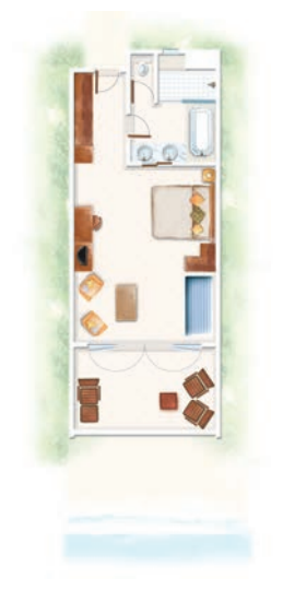
Superior Room First Floor