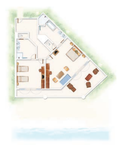
2-Bedroom Family Apartment