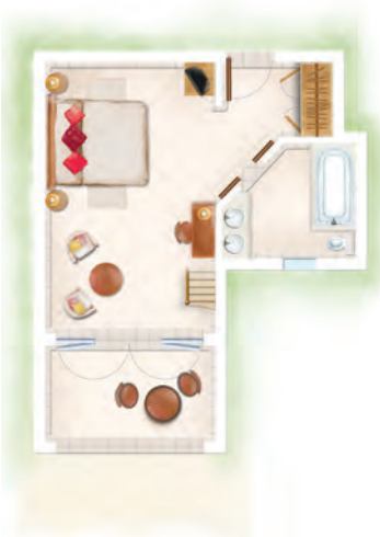
Family Duplex - Ground floor