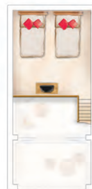
Family Duplex mezzanine