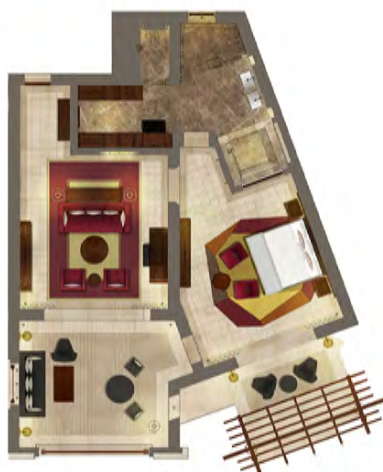
• Senior Suite