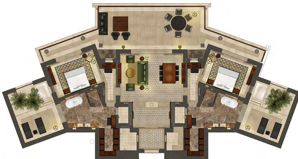
• Presidential Suite