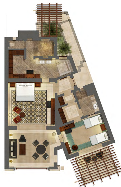
• Garden Suite