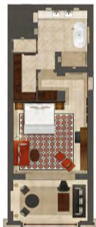
• Junior Suite