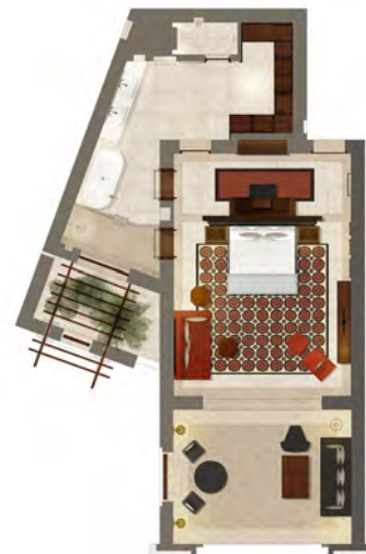
• Palm Suite