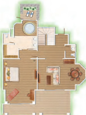
Family Suite Ground floor