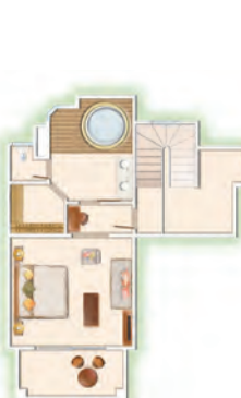
Family Suite 1 st floor