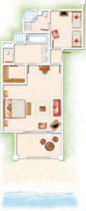
2-Bedroom Family Apartment