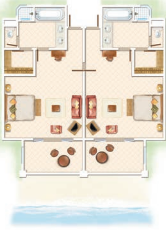
Deluxe Family Apartment