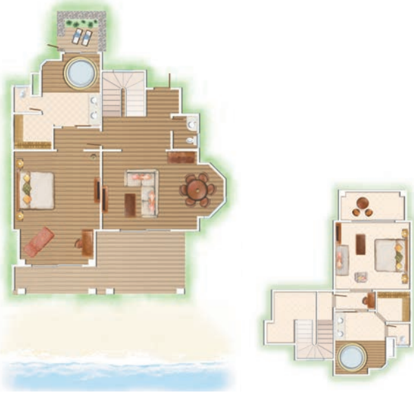
2-Bedroom Family Suite