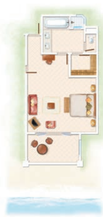
Deluxe Room / Deluxe Ground Floor