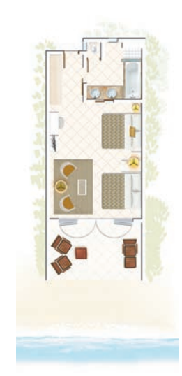
Deluxe Room / Deluxe Ground Floor