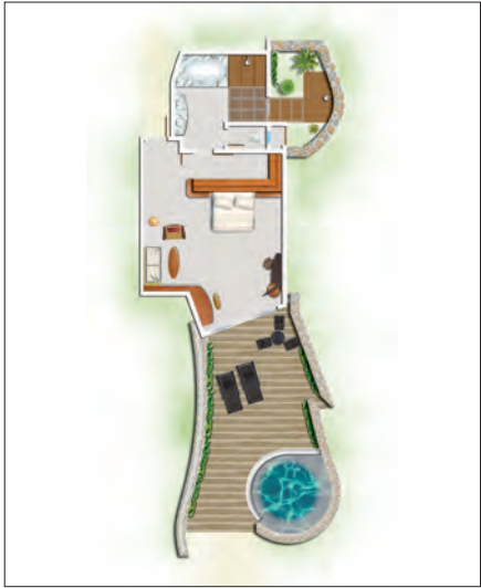
Beachfront Suite with pool