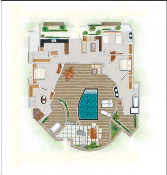
3-Bedroom Pool Villa