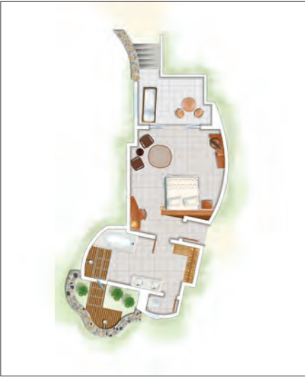
Tropical Junior Suite / Suite Golf