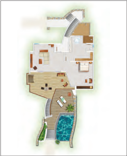
Beachfront Senior Suite with pool