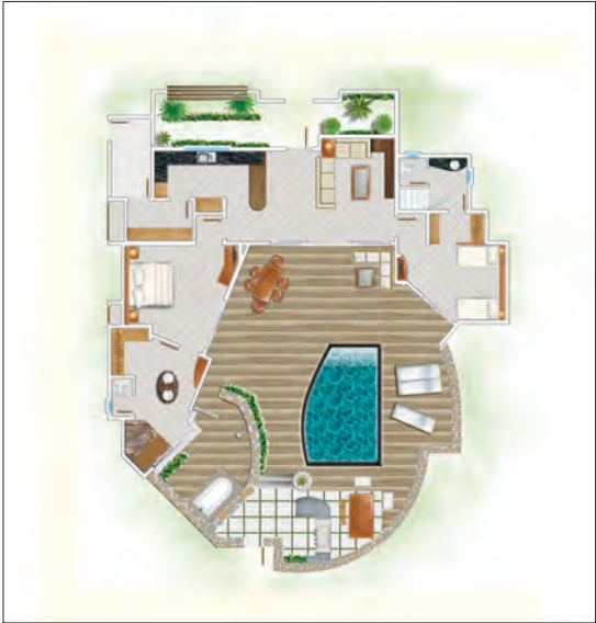
2-Bedroom Pool Villa