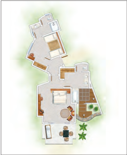
2-Bedroom Family Suite