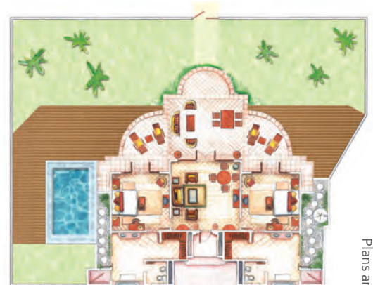
Senior Beach Villa with pool