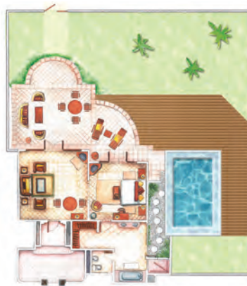
Beach Villa with pool