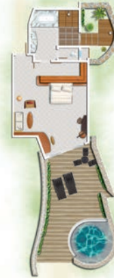
Beachfront Suite with pool