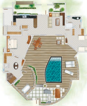
2-Bedroom Pool Villa