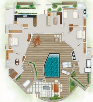
3-Bedroom Pool Villa