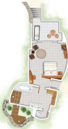
Tropical Junior Suite