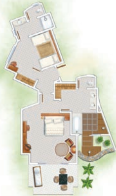
2-Bedroom Family Suite