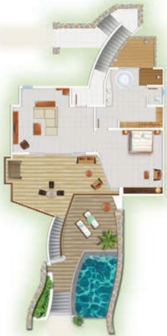
Beachfront Senior Suite with pool