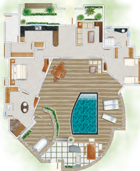
Two-bedroom Pool Villa

N.B. A non-smoking policy is applicable in Mauritius since 2009. Each client must comply with the law in force in Mauritius.