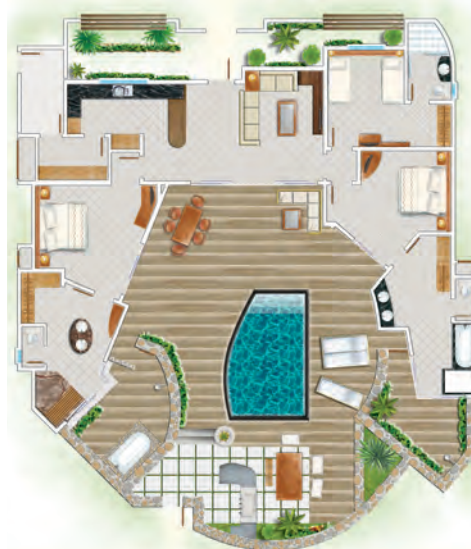
Three-bedroom Pool Villa