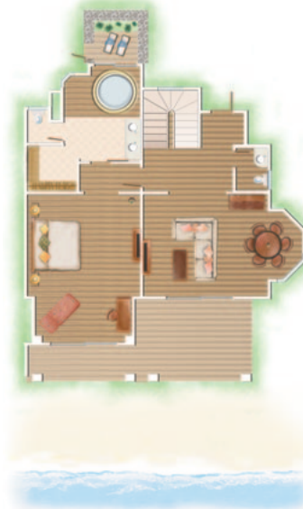
2-Bedroom Family Suite