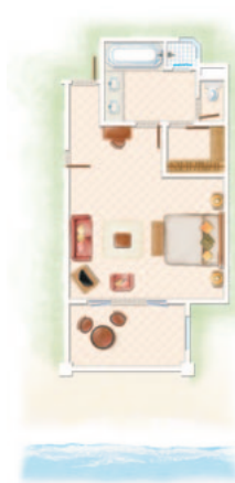
Deluxe Room / Deluxe Ground Floor