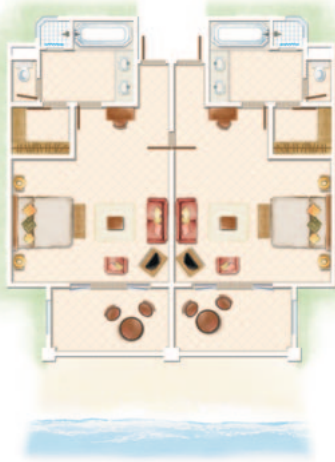
Deluxe Family Apartment