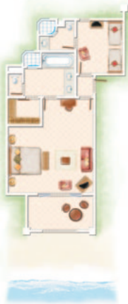
2-Bedroom Family Apartment