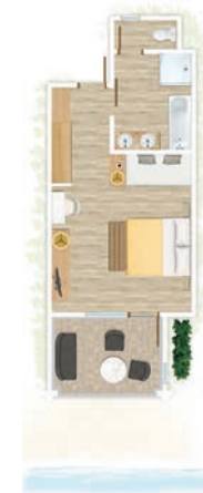
Deluxe Sea Facing Room