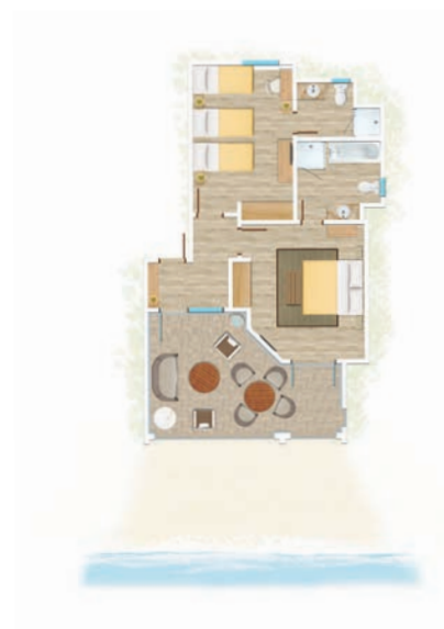
2-Bedroom Family Apartment