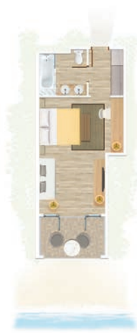
Superior Garden / Superior Sea facing