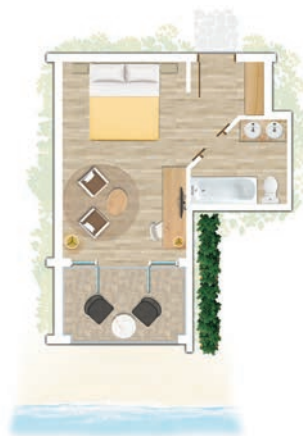
Standard Sea facing