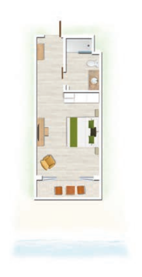
Standard Room / Standard Beachfront