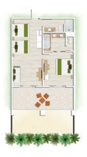
2-Bedroom Family Apartment