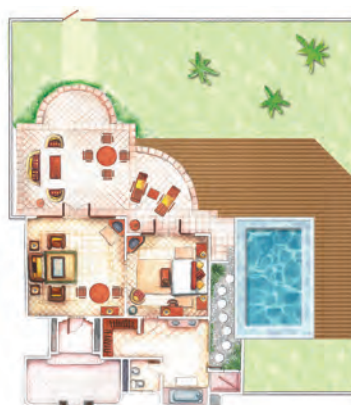
Beach Villa with pool