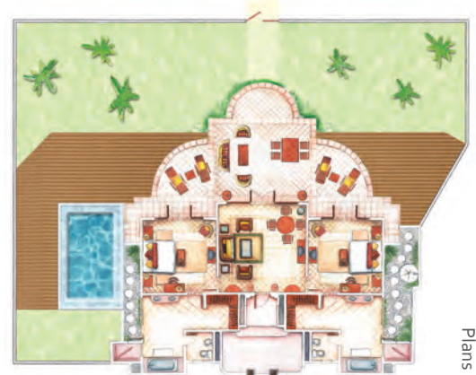
Senior Beach Villa with pool