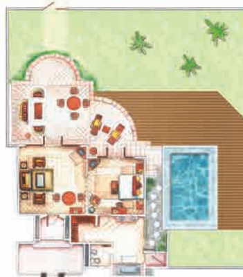
Beach Villa with pool