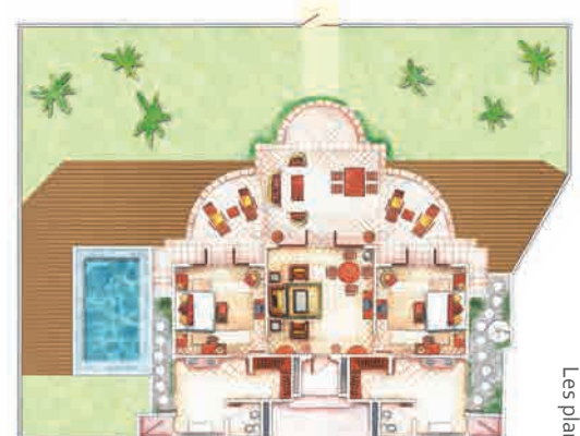
Senior Beach Villa with pool