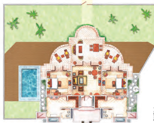
Senior Beach Villa with pool