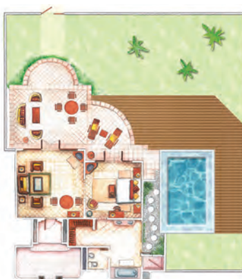
Beach Villa with pool