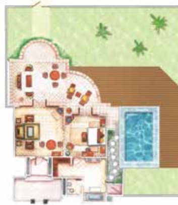
Beach Villa with pool