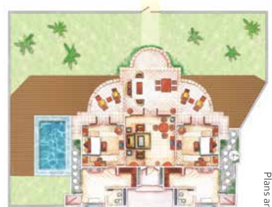
Senior Beach Villa with pool